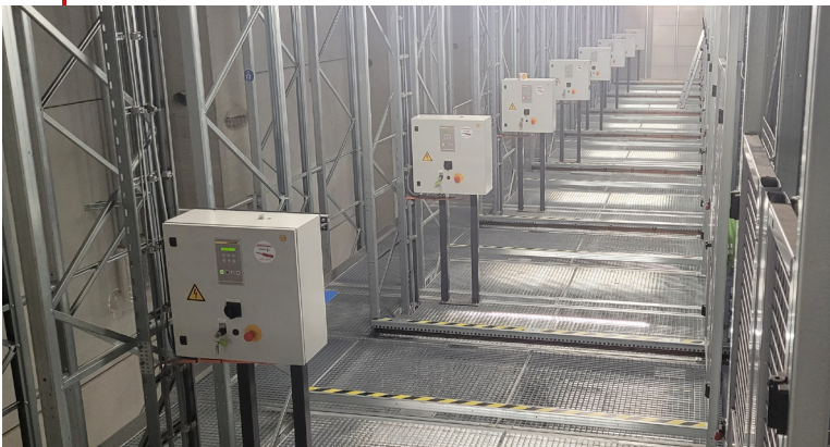
AMFE protected areas at Liebherr-Logistics GmbH

In the event of a fire, the AMFE triggers at an earlier stage, either thermally or via smoke detectors, and automatically reports the fire to the higher-level fire alarm system. This prevents fires from spreading in the first place and protects employees from the dangers of fire at all times. Thanks to AMFE and multialert®, production and shipping stoppages as well as plant downtimes are prevented. Loss of goods due to the consequences of fire can be virtually ruled out. In this way, we help to guarantee the uninterrupted supply of spare parts by Liebherr-Logistics GmbH worldwide. For questions about application possibilities or technical details of the AMFE mini fire extinguisher, please contact Rajko Eichhorn ( rajko.eichhorn@job-group.com ).